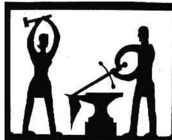
[Thanks to Plowshares activists for this graphic.]

Destroying nuclear weapons and resolving the problems of nuclear waste, power and uranium mining will also take cooperation of all governments, and also from corporations now profiting from the nuclear industry. The alternative is almost certainly the extinction of the human race.